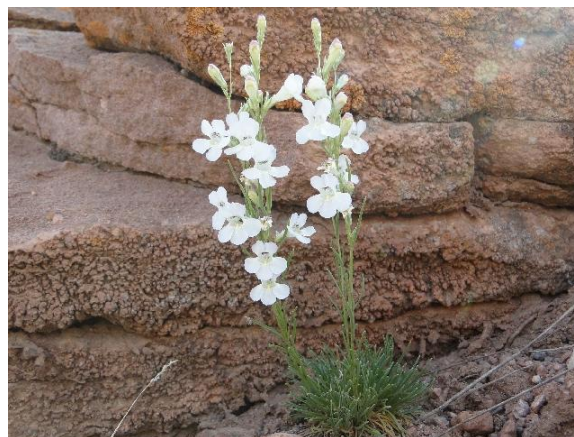
Penstemon laricifolius v. exilifolius

If you are interested in learning about Penstemons, one of the best ways is to join the American Penstemon Society and attend the annual Penstemon Society Meeting. This year the meeting was held in Laramie, Wyoming. It has been hot and dry in Wyoming this year but, even in a dry year, there are always a surprising number of interesting plants to be seen when you go out on field trips. Obviously Penstemons were the target plant at this meeting but, with the drought, the Penstemons were not