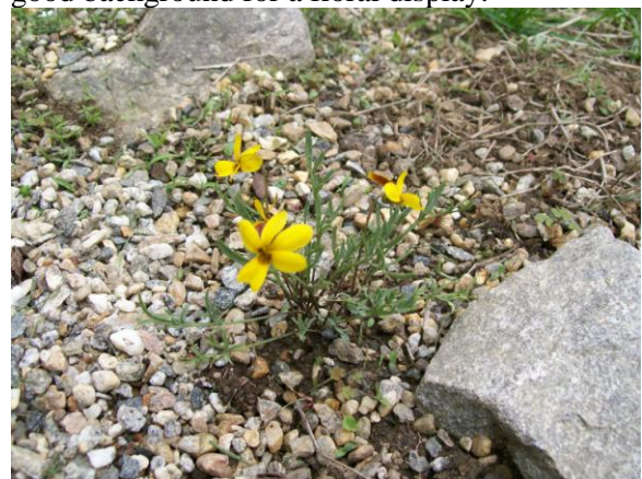
Viola douglasii