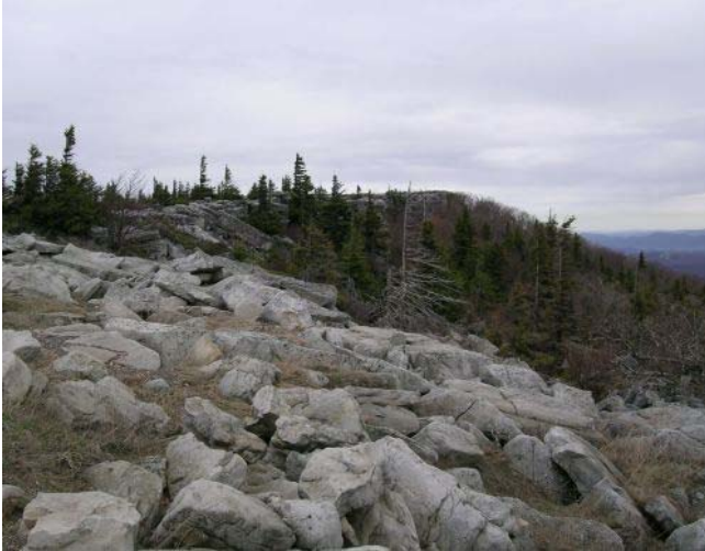
Bear Rocks fellfield

The Canaan Valley Resort lies amid the beautiful hills of West Virginia. As well as the wonderful scenery, there is a golf course, swimming pool, tennis courts and many interesting hiking trails. Make reservations directly with the resort, and ask for the special NARGS rate of $78 single, $85 double. Call 1-800-622-4121.