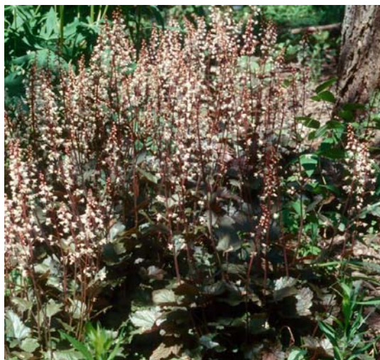
Primrose Path Plants -- heucherella 'quicksilver'_3_.jpg